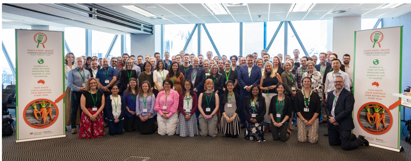
First annual conference of the Fight Food Waste CRC at KPMG, Melbourne, November 2019.